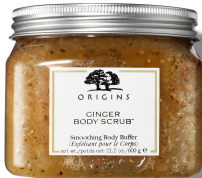
GINGER BODY SCRUB™ SMOOTHING BODY BUFFER 21.2oz $43