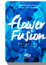
FLOWER FUSION™ – LAVENDER HYDRATING SHEET MASK $7 Also available in Orange Flower, Rose & Violet.