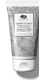
WARM DOWN™ – WARMING LAVA SCRUB TO DETOX & SMOOTH 5oz $37.50