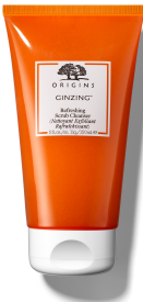
GINZING™ REFRESHING SCRUB CLEANSER 5oz $23