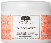
GLOOMAWAY™ GRAPEFRUIT BODY SOUFFLE 7oz $38