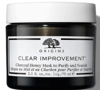
CLEAR IMPROVEMENT™ CHARCOAL HONEY MASK 2.5oz $34

SPA-WORTHY PRESENTS FOR LUXURIOUS "ME TIME"