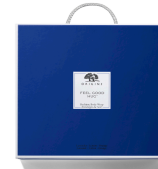
FEEL GOOD HUG™ BODY WRAP $45 Available in 3 scents.