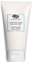
CHECKS AND BALANCES™ FROTHY FACE WASH