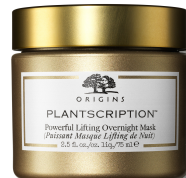
PLANTSRIPTION™ POWERFUL LIFTING OVERNIGHT MASK 2.5oz $65