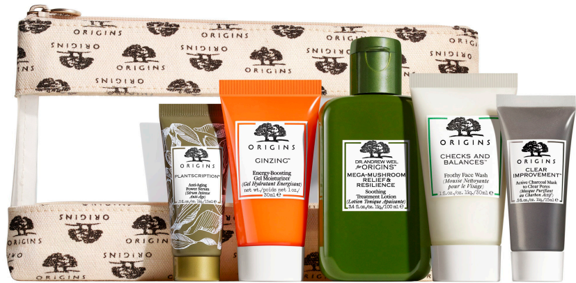
BEST SELLERS BEST SKIN SET

OUR MOST-LOVED PRODUCTS WILL STEAL THE SHOW