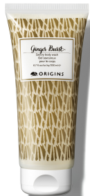
GINGER BURST™ BODY WASH 6.7oz $26