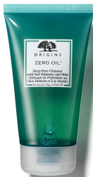
ZERO OIL™ CLEANSER 5oz $24