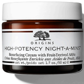
HIGH POTENCY NIGHT A MINS™ RESURFACING CREAM 1.7oz $47