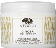
GINGER SOUFFLE™ WHIPPED BODY CREAM