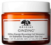
GINZING™ ENERGY BOOSTING MOISTURIZER