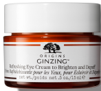
GINZING™ REFRESHING EYE CREAM TO BRIGHTEN & DEPUFF 0.5oz $33