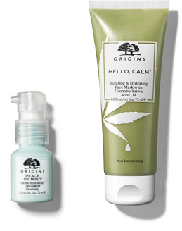
PEACE OF MIND™ ON-THE-SPOT RELIEF + HELLO CALM™ FACE MASK $51

SPA-WORTHY PRESENTS FOR LUXURIOUS "ME TIME"