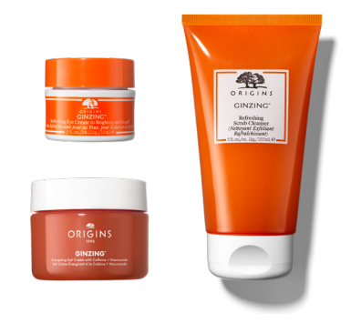
GINZING™ REFRESHING SCRUB CLEANSER + GINZING™ BRIGHTENING EYE CREAM + GINZING™ ENERGIZING GEL CREAM