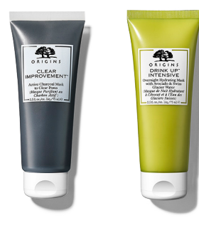
CLEAR IMPROVEMENT™ ACTIVE CHARCOAL MASK + DRINK UP™ INTENSIVE OVERNIGHT HYDRATING MASK